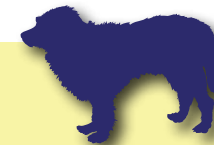
GIANT DOG (41 kg+)